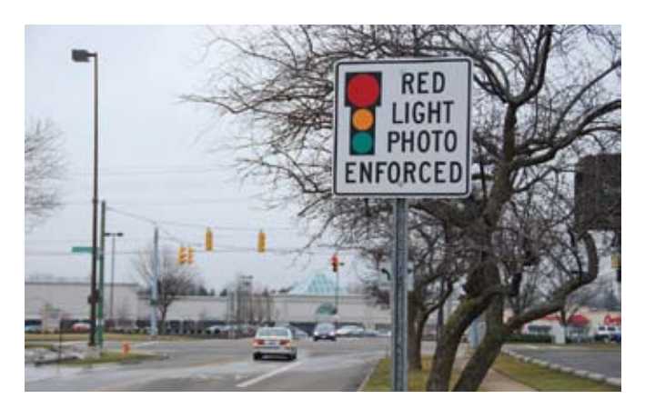
Many communities require signs to be posted before camera-equipped intersections, helping to deter violations of traffic laws.

to moving violations and then refer them to a collection agency to prevent citizens from ignoring tickets.<sup>20</sup>