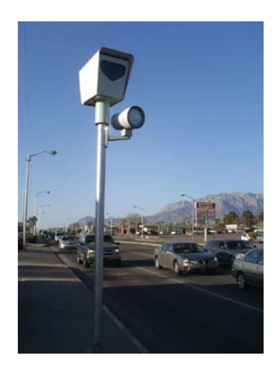
This camera system identifies violations of red-light signals at an intersection, transmitting evidence and vehicle identification information to the vendor. Vendors issue tickets, after approval by local authorities, which are then delivered to the registered owner of the vehicle.

State or local governments must specifically authorize enforcement agencies to cite violators by mail before automated enforcement systems can be used, making the registered vehicle owner responsible for the ticket. Law or judicial precedent must